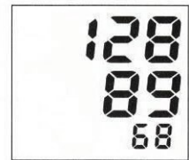
simultaneous measurement result display